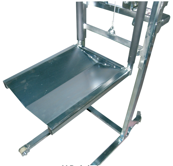
V-Bed platform Ref: 300 189