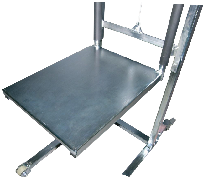
Platform Ref: 300 188